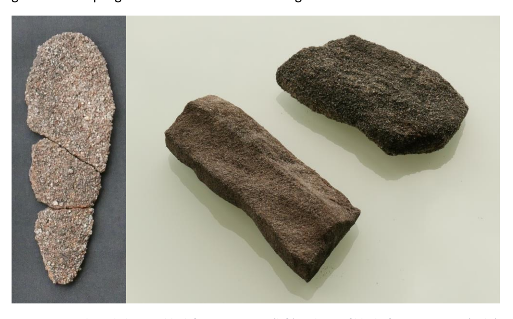
Figure 7 Pear-shaped abrasion block from Barrow 13 (left) and pair of blocks from Barrow 11 (right)

The smaller stone object from the Barrow 13 group is equally unusual – a thin pear-shaped piece, presumably carefully shaped; however, the coarse-grained and crumbly nature of the stone, which seems to have been vulnerable to the acid soil, precludes finding evidence of working since the original surface has deteriorated. The coarseness of the grain suggests that any functional use would have been for heavy duty or preliminary grinding or sanding. It could be held flat in the fingers to make use of its flat faces, or held knife-style to make use of the thin edges for reaming out grooves in wood, bone or even soft stone. Of the two sandstone blocks from Barrow 11, only the finer-grained example gives some indication of having been utilised.