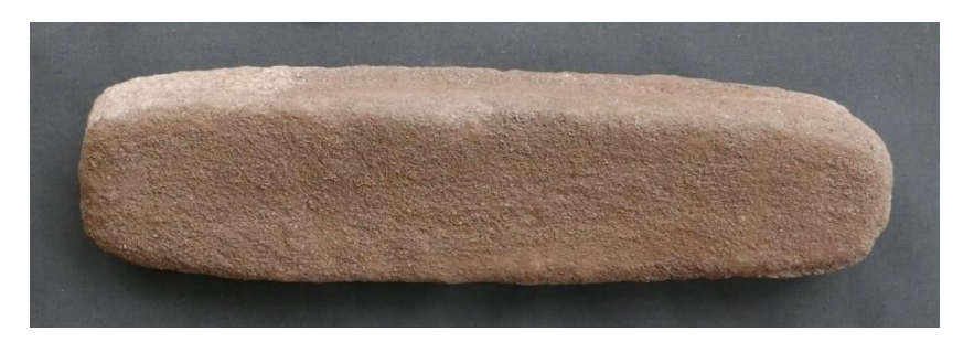
Figure 6 Large whetstone with furrowed sides, Barrow 13

The large whetstone from Barrow 13 is also rectanguloid, but is considerably larger than the perforated example just described. Stone blocks are not infrequently found in Early Bronze Age grave groups and others come from the mound make-up of round barrows. They vary considerably in size and shape, and doubtless in function too; no standardised type of similar scale and proportions to the Barrow 13 one has yet been recognised. Indeed, there seem to be few close parallels. Perhaps the best parallel is an even longer example (30cm) from an unrecorded context, but bearing the inscription 'King Barrow, Coneybury Hill', a site a little south-east of Stonehenge (Amesbury G23 – Grinsell 1957, 150; object in Salisbury Museum). The King Barrow example, however, lacks the light furrowing of the sides seen on this one. The rock type of the Petersfield Heath example remains to be ascertained, but it is moderately fine-grained and would certainly serve for whetting or fine sanding. The side furrows could have given it a broader options for use; alternatively they may have allowed this heavy object to be held by a thong for everyday carriage – an alternative mode of suspension to the perforation (we are grateful to David Wilkinson for this suggestion).