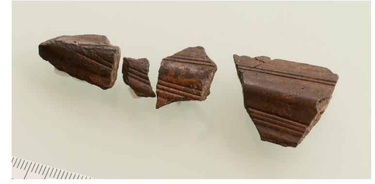
Figure 8 Bronze dagger fragments from the lower blade; image Stuart Needham

of the Camerton-Snowshill series (Gerloff 1975, 99-128), now placed within a broader family termed Series 5 (Needham 2015, 9-11). One slightly unusual feature for the type is that the groove-bands extend almost to the tip of the blade, rather than converging higher. It remains to be examined what if any significance this has.