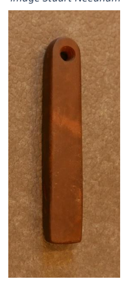
Figure 10 Perforated whetstone from The Devil's Humps, Bow Hill; image Stuart Needham

groups of stone working blocks at the national level come from the 'shaman's grave', an inhumation at Upton Lovell G2a, Wiltshire (Cunnington 1806; Annable & Simpson 1964, 49-50 nos 242-262), and a Collared Urn cremation deposit from Sandmill, Dumfries & Galloway (Clarke et al 1985, 295-6 fig 7.31). In both contexts a stone battle-axe was also present. The stone blocks at Upton Lovell are very varied and the largest, although not neatly shaped, is about 210mm long and described by Cunnington as 'of granite or moor-stone'; it may be one of the two pieces in this group that has been petrologically identified as having a Cornish source (Annable & Simpson 1964; Clough & Cummins 1988, 157 nos 84 & 85).