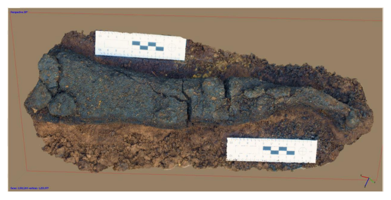
Figure 9 The upper face of the mineral-replaced handle from Barrow 13; the colour has been manipulated to differentiate the object from the surrounding soil better

This is an entirely novel component of the funerary repertoire for the Early Bronze Age, perhaps more due to the frequency with which organic goods decayed than original rarity. Nevertheless, we should not assume it was the norm, or even necessarily a frequent way of bearing the cremation. A high proportion of Early Bronze Age cremations were buried in pottery vessels, and it may be that these are alternative ways of containing and carrying the deceased's remains. This unique handle does, however, hint at largely hidden aspects of the funerary process — not only the role of well-crafted organic objects, but also the formality that might be involved in the carriage of the precious remains to their final resting place. There is no evidence to suggest how far away from Barrow 13 the act of cremation may have taken place, but it is worth noting that large-scale excavation of Early Bronze Age barrows only occasionally yields evidence for a funeral pyre on the burial site itself.