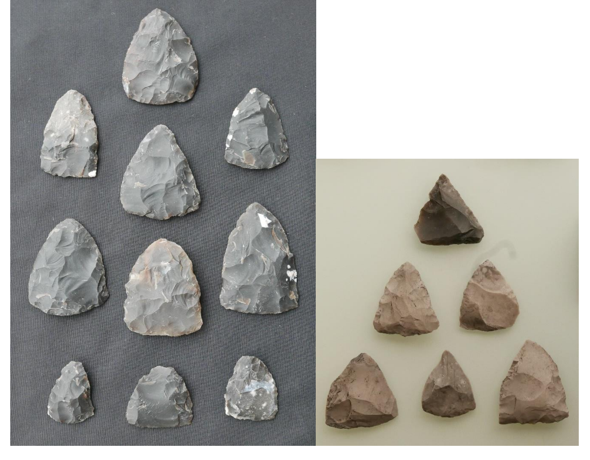
Figure 1 Sub-triangular arrowhead blanks from Barrow 13 (left) and Barrow 11 (right)

Symmetrical triangular arrowheads are not a recurrent feature of British prehistory, nor is there any other small flint type of triangular shape. The identification of these partially flaked flints in both grave groups as pre-forms for barbed-and-tanged arrowheads is therefore secure and is supported by grave groups that have both sub-triangular pre-forms and finished arrowheads – such as the Amesbury Archer's (Boscombe Down), Wiltshire, and that from Breach Farm, Llanbleddian, Vale of Glamorgan (Harding 2011; Grimes 1938; Clarke et al. 1985 161 fig 4.98). Finishing the implements would have required, in most cases, further thinning by surface flaking and the careful double notching of the base to create a medial tang flanked by a 'barb' to either side. Barbed-and-tanged arrowheads vary considerably in size, detailed shape and quality of workmanship. It is possible, nevertheless, that two or three of the pre-forms from Petersfield Heath would have been too small to produce an arrowhead after further flaking.