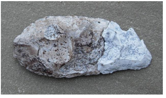
Figure 3 Flint striker, or fabricator, from Barrow 11; image Stuart Needham

Figure 4 Burnt flint knife, badly heat-spalled and split in two; image Stuart Needham